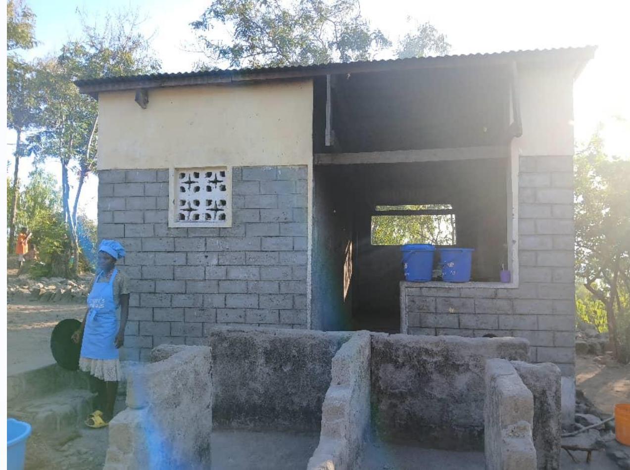
Chiteko school kitchen