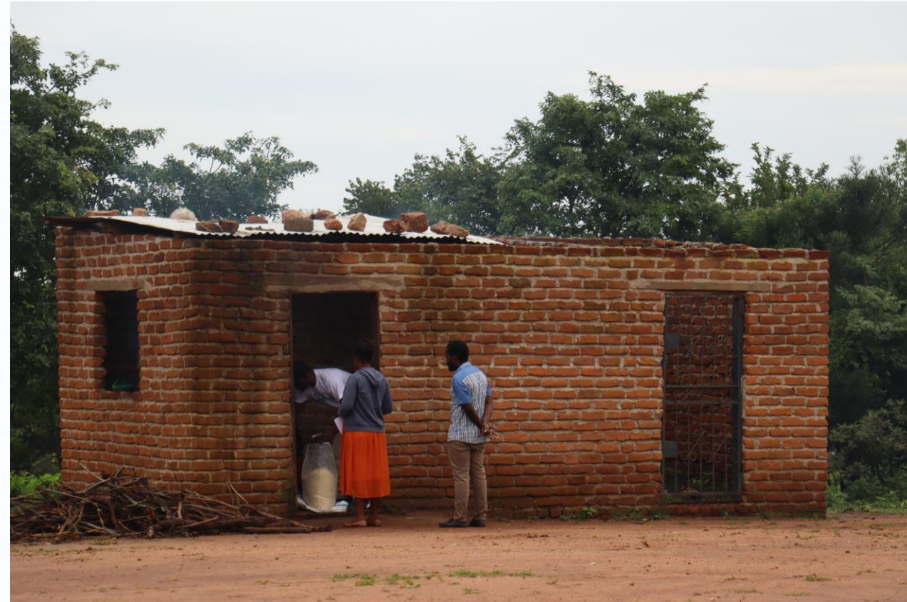
Kamwaza Comm school kitchen