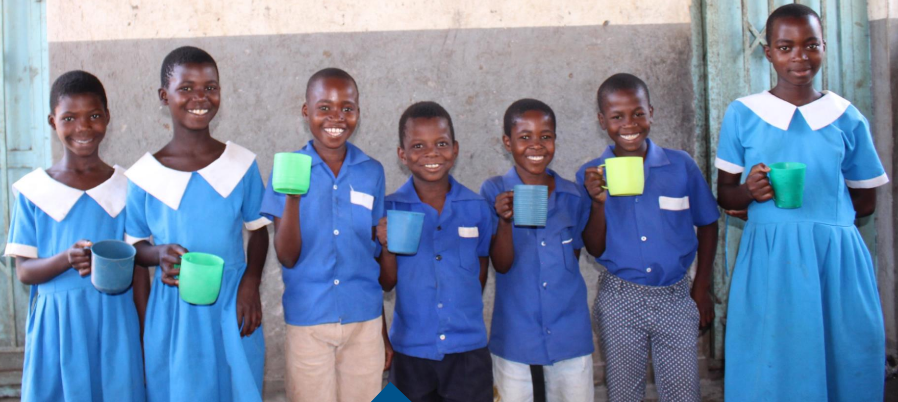
Namwiri Primary School

Namwiri Primary School "School feeding is sponsored here thanks to generous donors from Mary's Meals Czech Republic; Friends from Czech Republic."