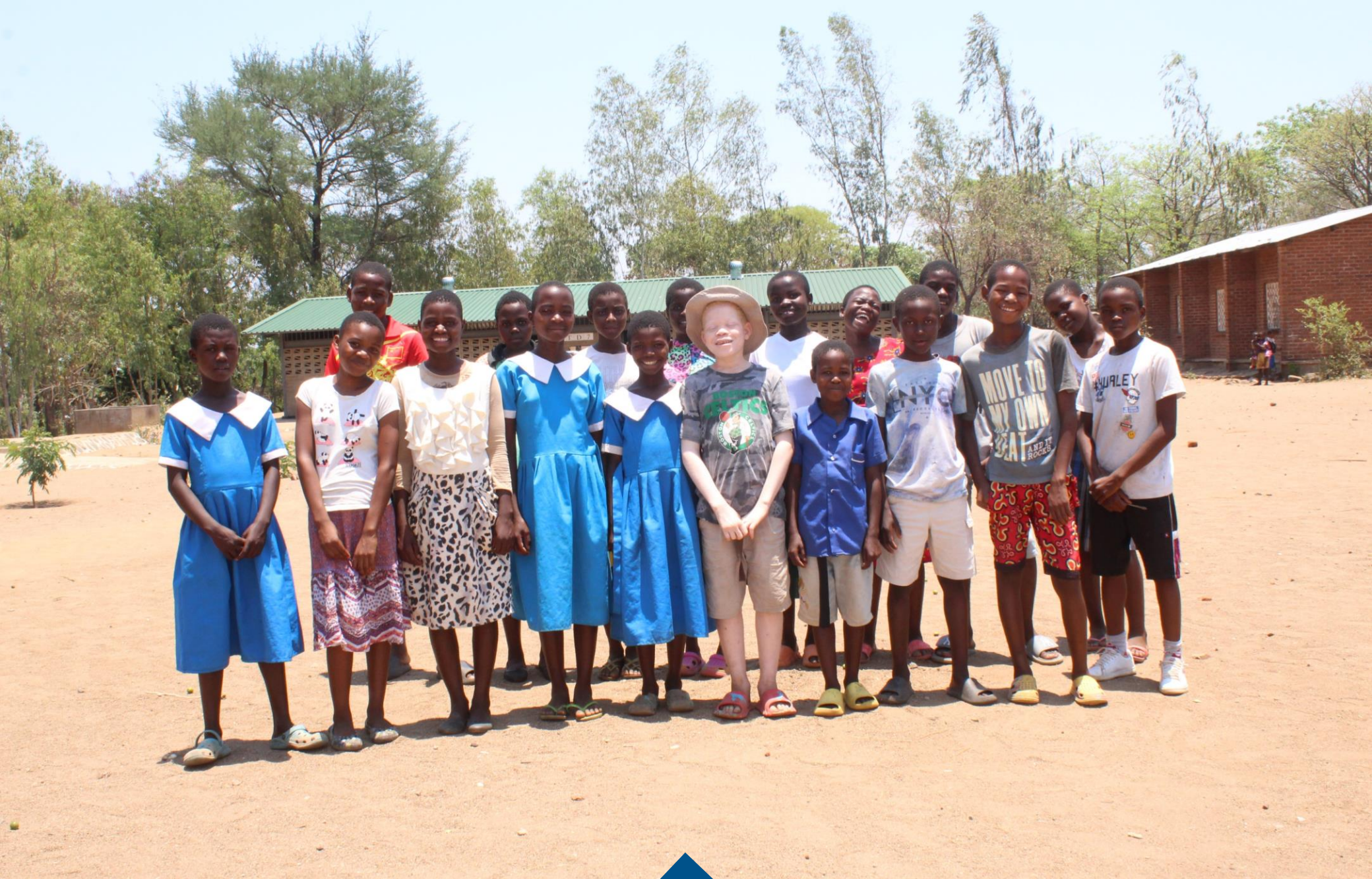
Namwiri Primary School