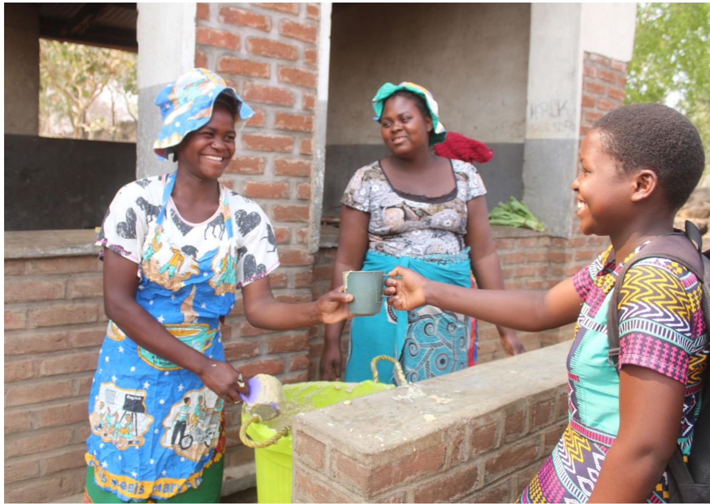
Namwiri Primary School