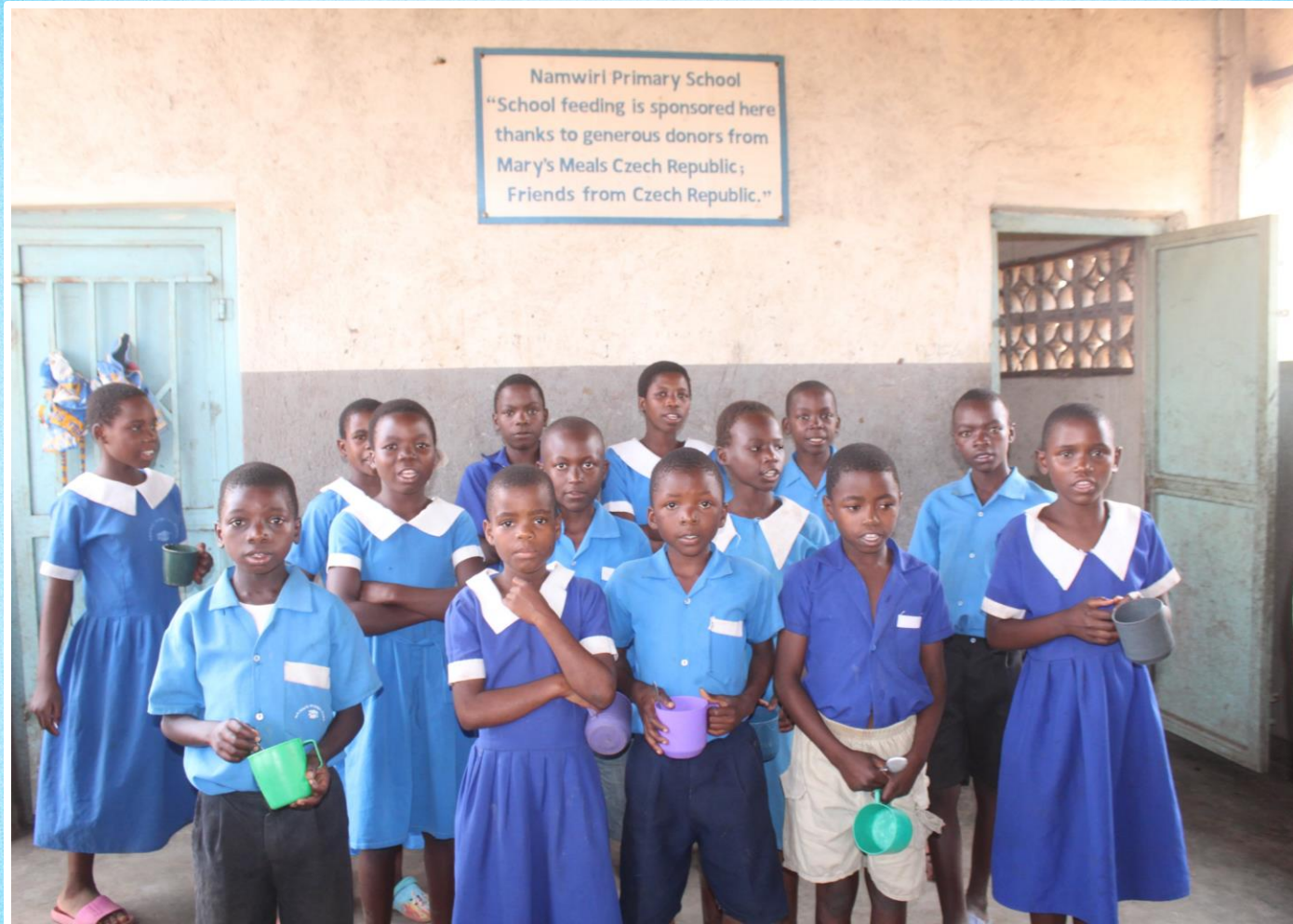
Namwiri Primary School