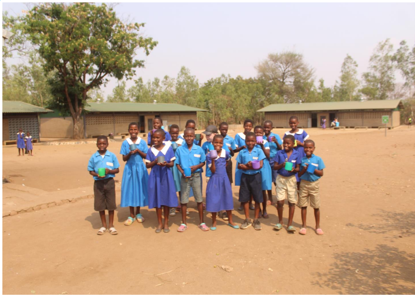
Namwiri Primary School