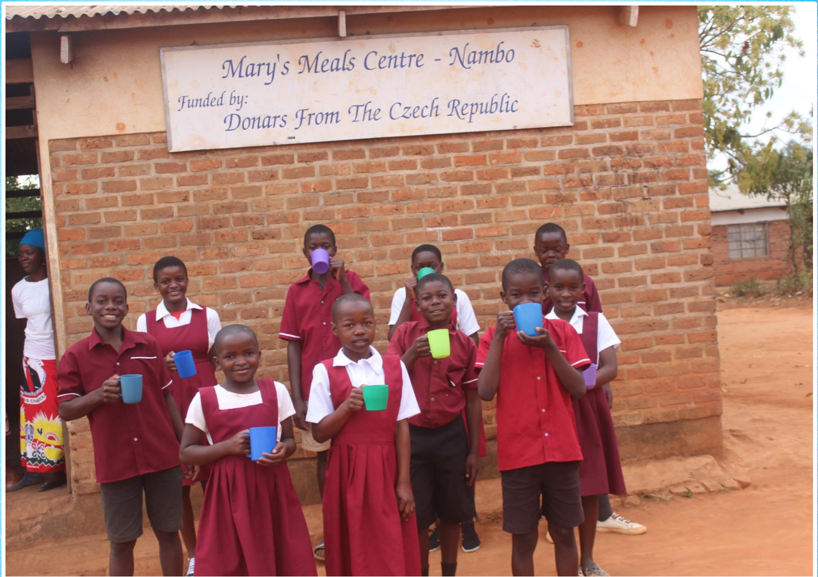
Nambo Primary School, Mzuzu, Malawi