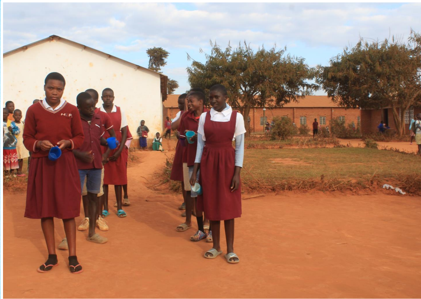
Nambo Primary School, Mzuzu, Malawi