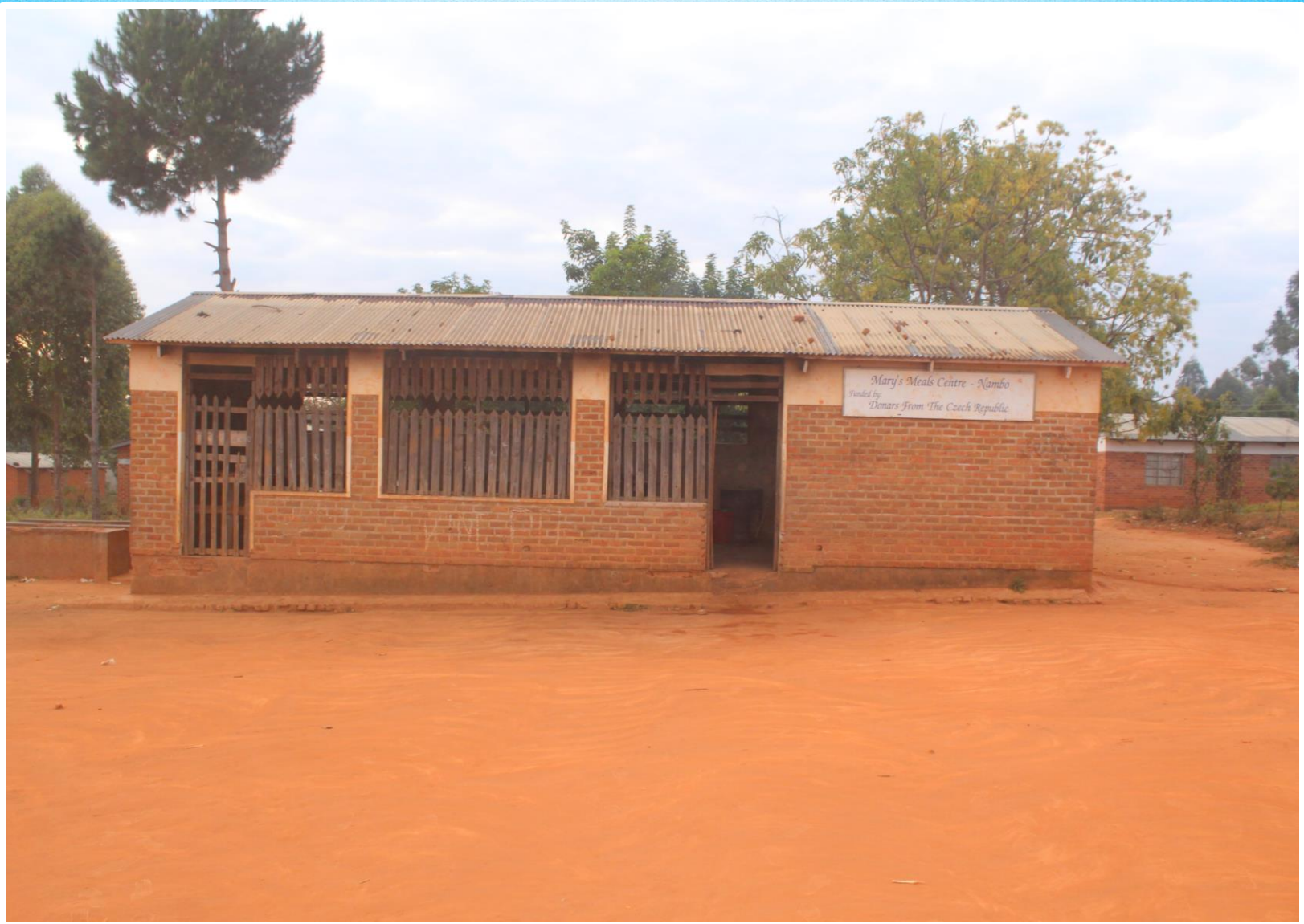
Nambo Primary School Kitchen