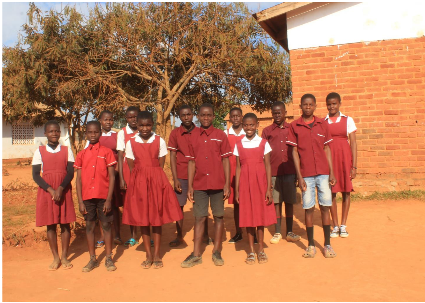
Nambo Primary School, Mzuzu, Malawi