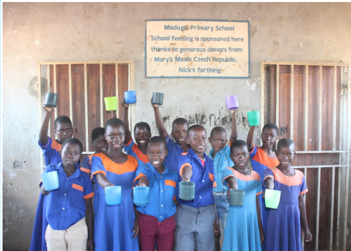
Madugu Primary School, Chikwawa, Malawi