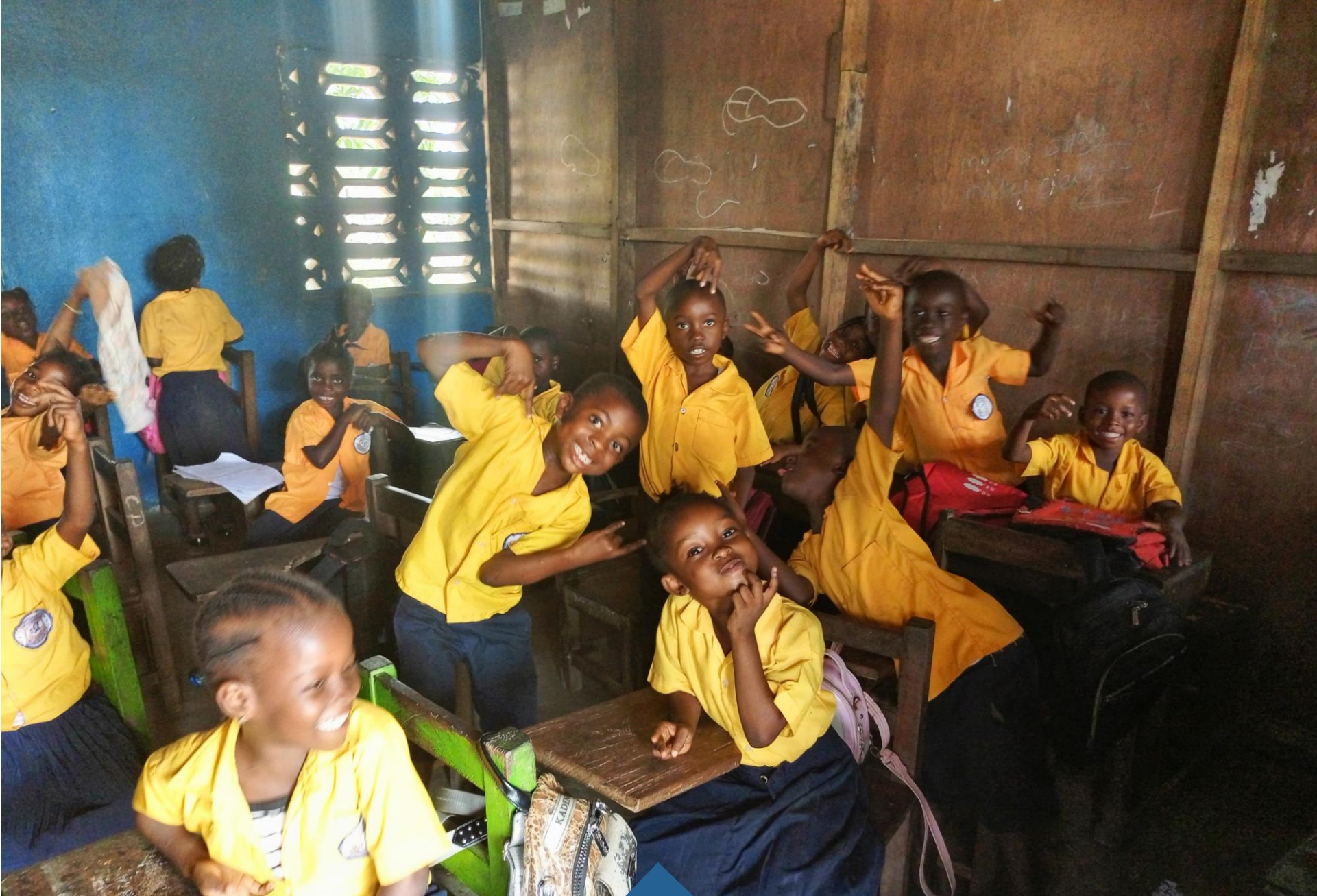
Joseph Jenkins Roberts Memorial United Methodist School