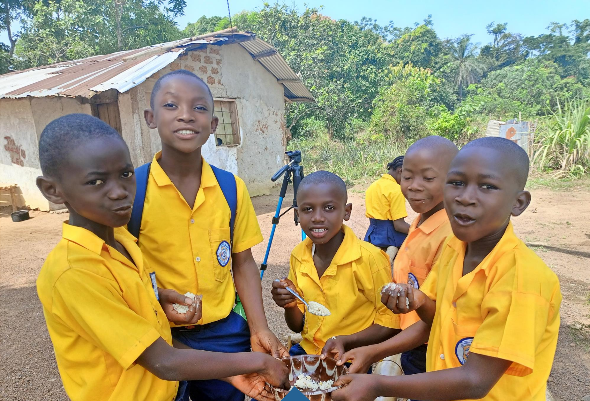
Joseph Jenkins Roberts Memorial United Methodist School