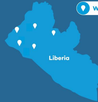
Where we feed