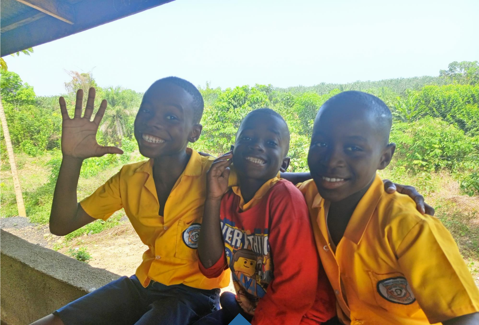
Joseph Jenkins Roberts Memorial United Methodist School